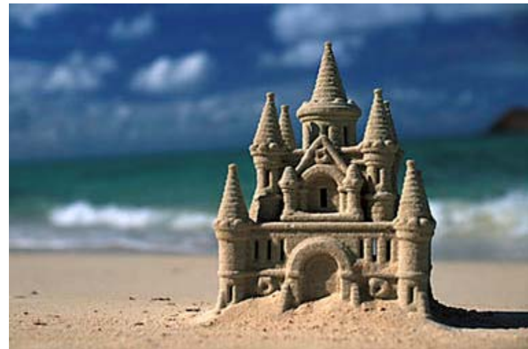
Meaningful Use of Sand